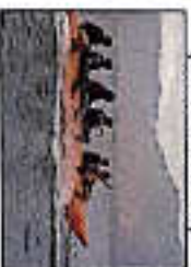
Dhom Dam (9 kms from Wai)