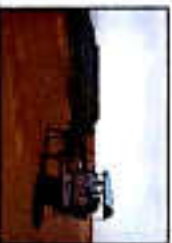
Panchgani (12kms from Wai)

Wai is a town in Satara district in Maharashtra, India. It is also known as 'DAKSHIN KASHI' in old times it was known as 'VIRAT NAGARI' Wai is known in Maharashtra as its ghats on the banks of the Krishna river & its temples, including especially 'The Dholya Ganpati' temple. The town is famous for the preparation of The Marathi Vishwakosha & Dharmkosha. Some of the many interesting places for site seeing around Wai are :