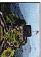
Pratapgad (45 kms from Wai )