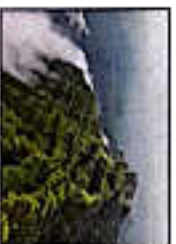
Mahabaleshwar (32 kms from Wai)